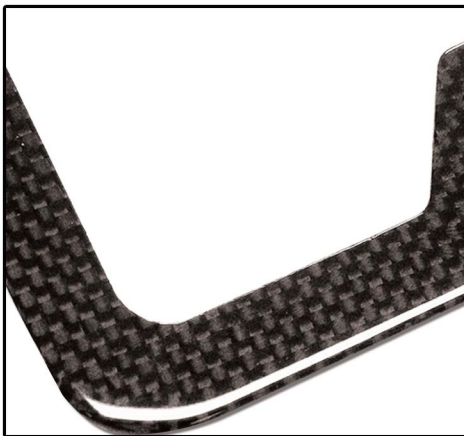
All of our carbon fiber composite features an attractive hand polished clear coat that enhances the carbon fiber weave.